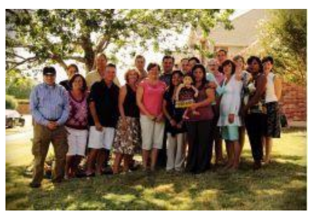
Family Portrait: A graduated Sister in Dallas, TX and her Table.

Each Table is hosted by a congregation (up to three congregations may share a Table). A required team of volunteers (10-12 people help an adult or family and 6-7 help a young adult transitioning out of foster care or a veteran) serve over an 8 – 12 month period. Tables generally meet once a week and often at a lesser intensity as the work progresses. Table members are primarily generalists, work as teams and also provide leadership for important life domains (see Open Table model diagram). A national team of volunteer Open Table Coaches train a volunteer Congregation Coordinator in each faith community to lead the model and launch Tables.